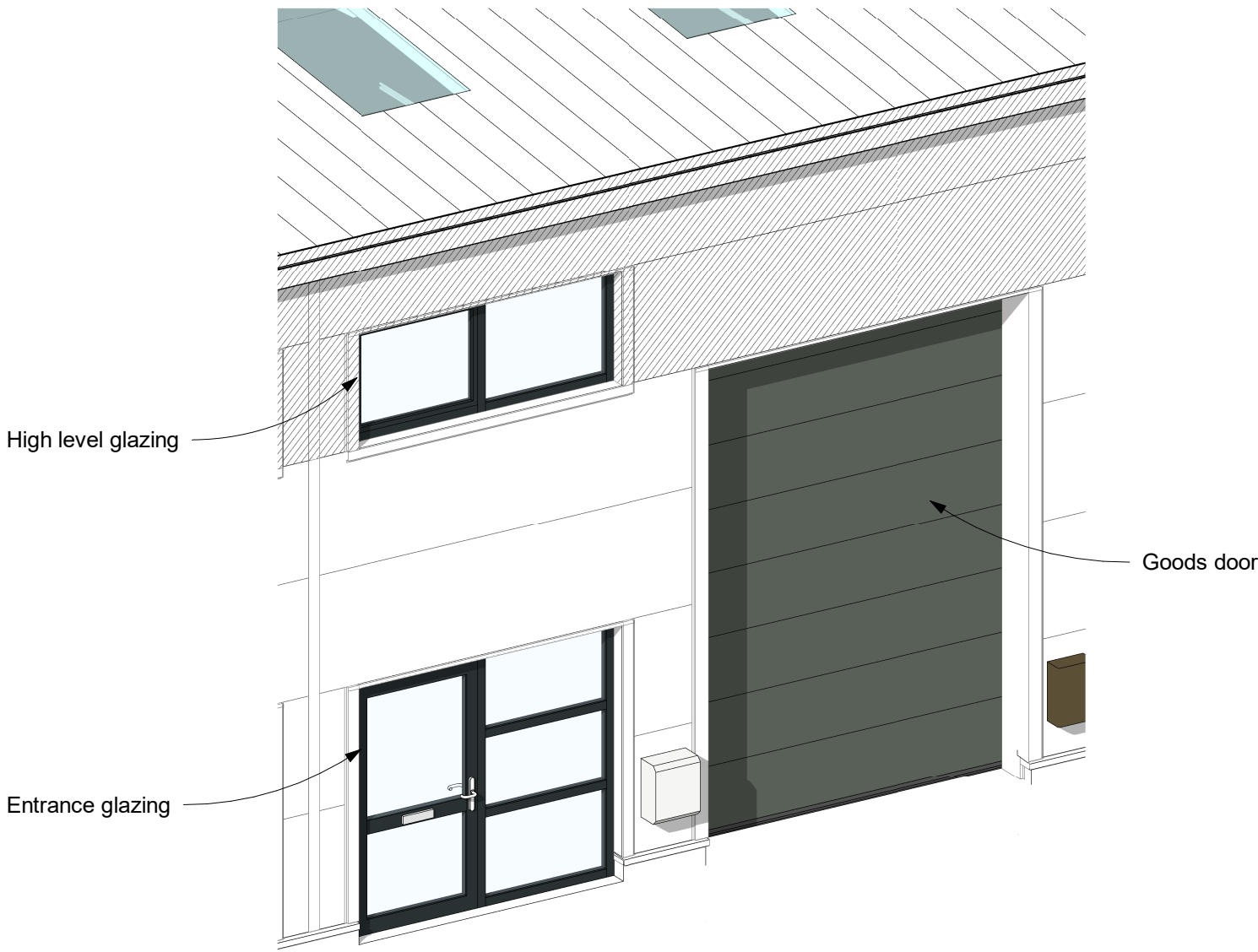
Typical Entrance Glazing & Goods Door Arrangement

NOTE:- Glazing Type 2ER is handed (right hand opening - not shown)